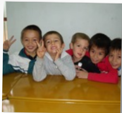
THE BOYS AT THE CENTER