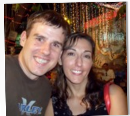
AT THE CARNIVAL IN HANOI